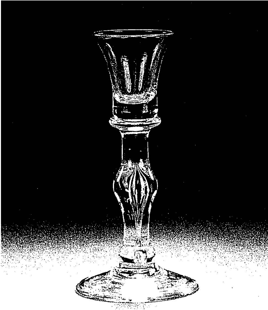
Maxine Berg, Luxury and Pleasure in Eighteenth-Century Britain , Oxford: Oxford University Press, 2005, p. 125.