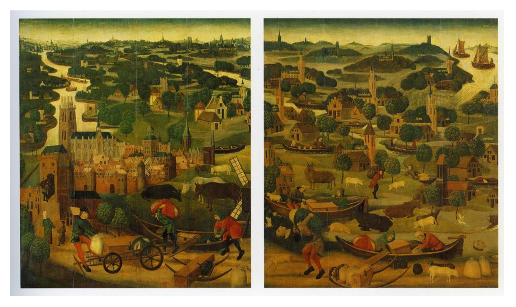
St. Elizabeth Day Flood, Master of the Elizabeth Day Flood, circa 1470.