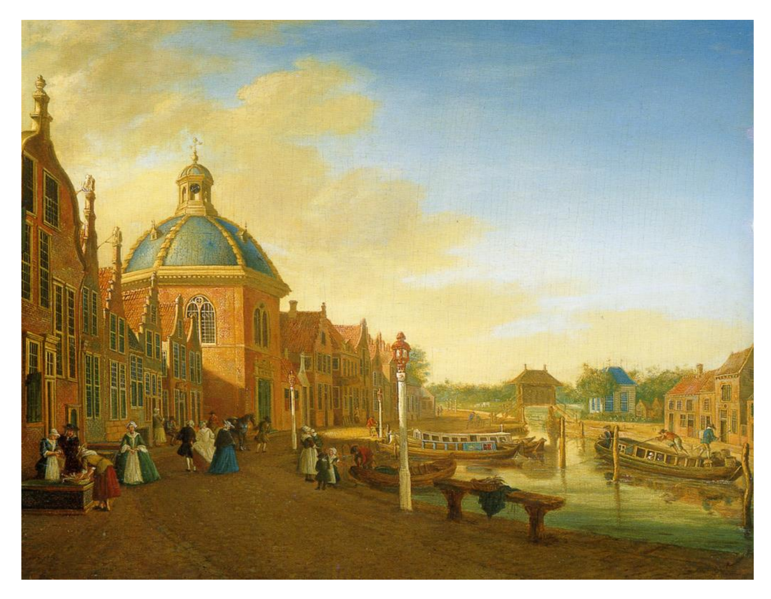
View of Leidschendam with trekschuiten (passenger canal barges). Paulus Constantine La Farque, oil on canvas, 1756, Rijksmuseum, Amsterdam.