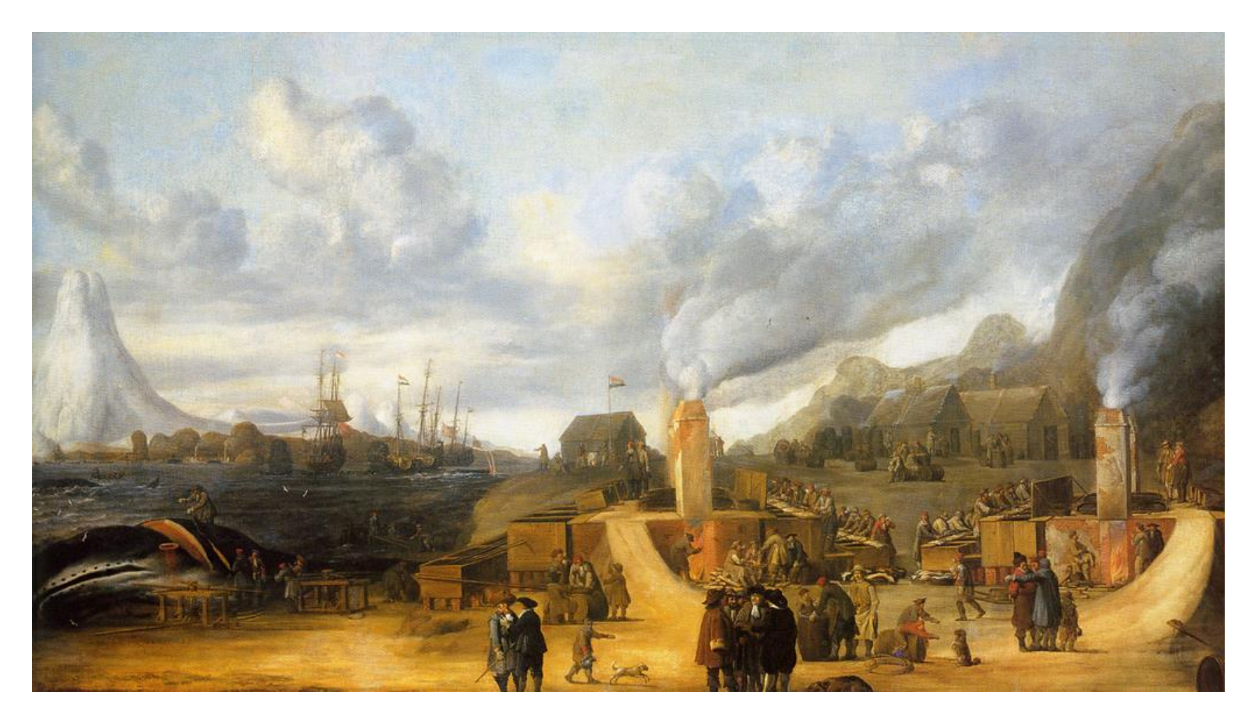
Tryworks (whale oil refinery) of the Amsterdam Chamber of the Company of the North on Jan Mayen Island, Cornelis de Man, oil on canvas, 1639, Rijksmuseum, Amsterdam.