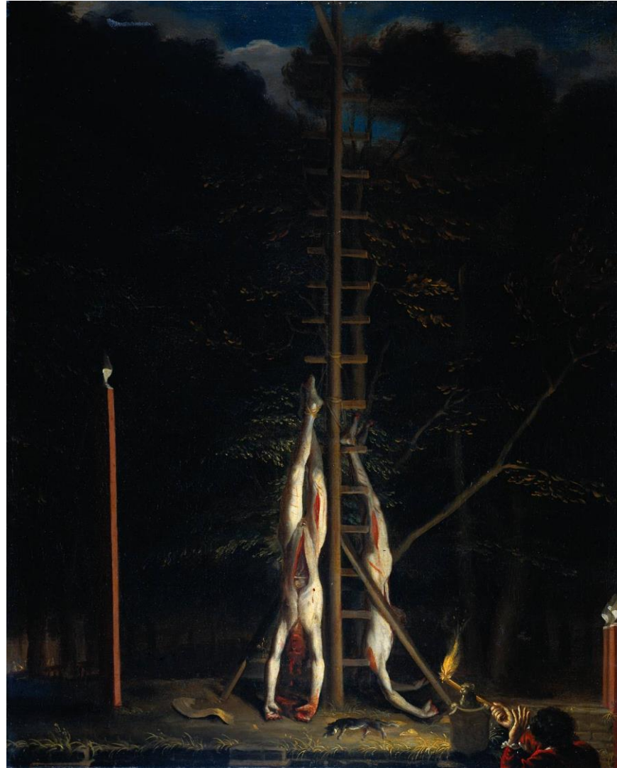
Bodies of the Brothers de Witt, displayed hanging from the gallows at the Vijverberg in The Hague, 1672, Detail. Attributed to Jan de Baen, oil on canvas, Rijksmuseum, Amsterdam. The de Witts brothers were were blamed for leaving the Republic unprepared for the French and English attack of 1672 and were lynched by a mob.