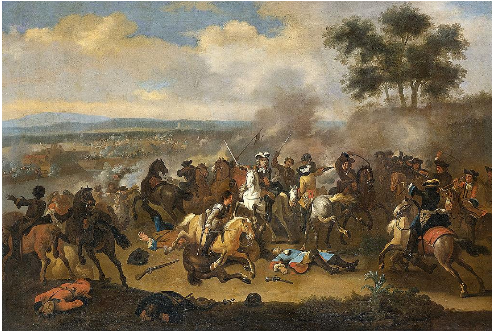
Battle of the Boyne between James II and William III, July 12, 1690. Johan van Huchtenburg, oil on canvas, circa 1690-1733, Rijksmuseum, Amsterdam. This was the decisive battle in which William defeated James II's French forces and the Irish rebels.