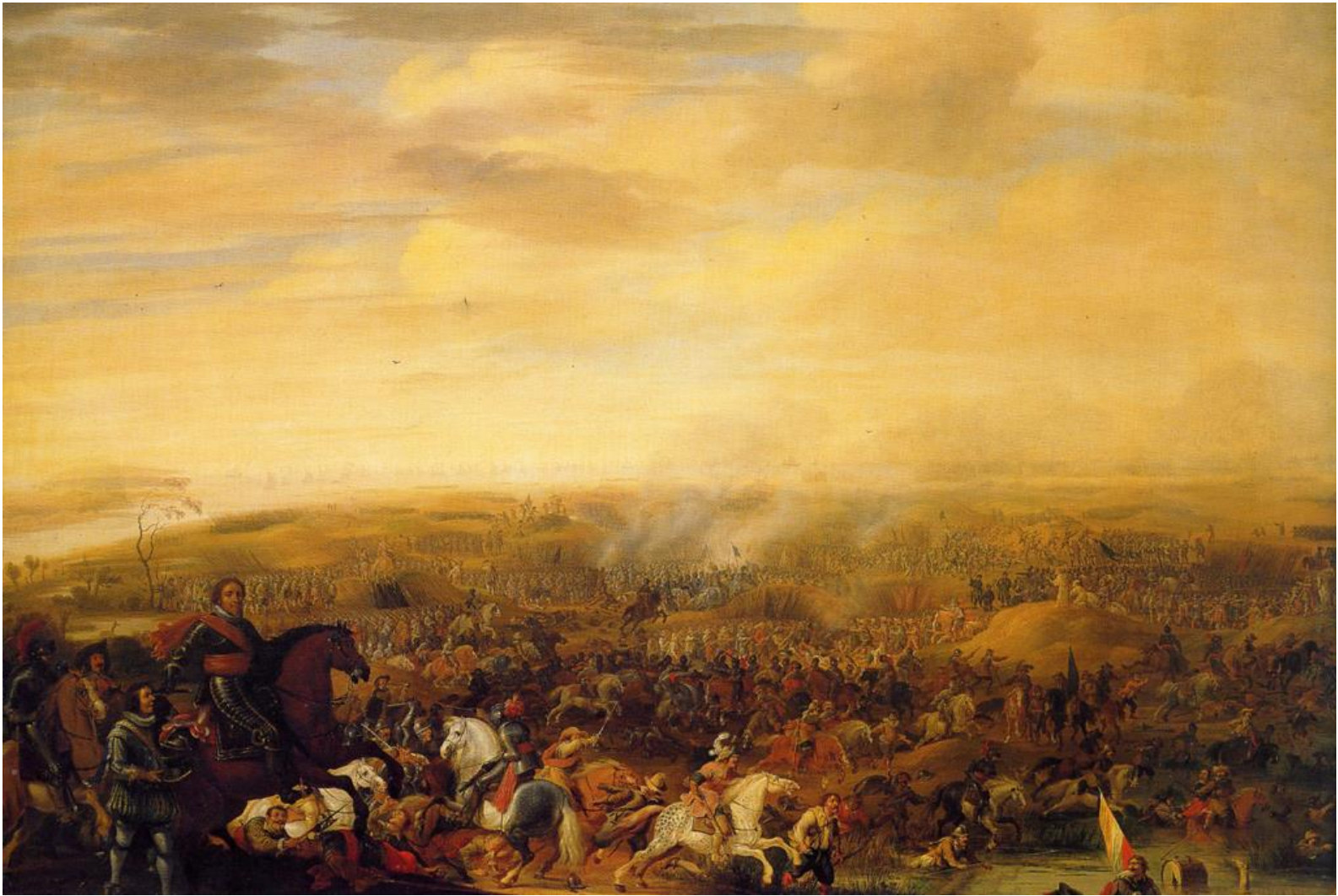
Prince Maurits, the Battle by Nieuwport, 1600, Pauwels van Hillegaert, oil on wooden panel, Rijksmuseum, Amsterdam