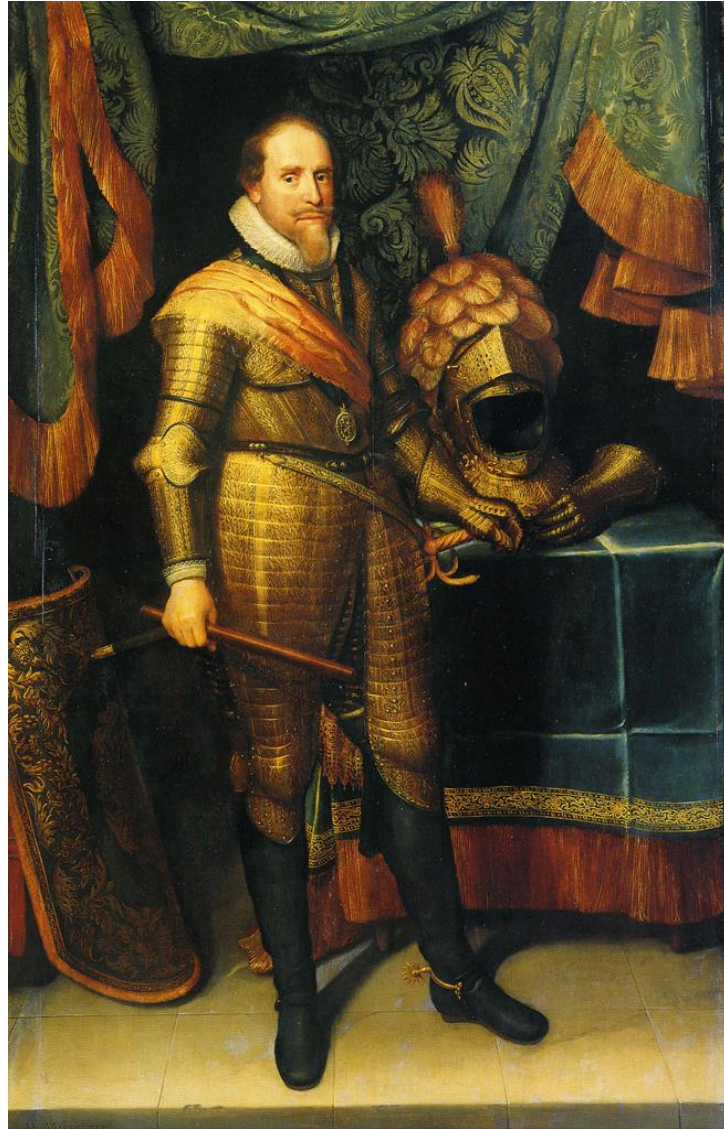
Prince Maurits of Orange (1567-1625), Michiel Jansz. Van Miereveld, first quarter of the 17 th century, Rijksmuseum, Amsterdam.