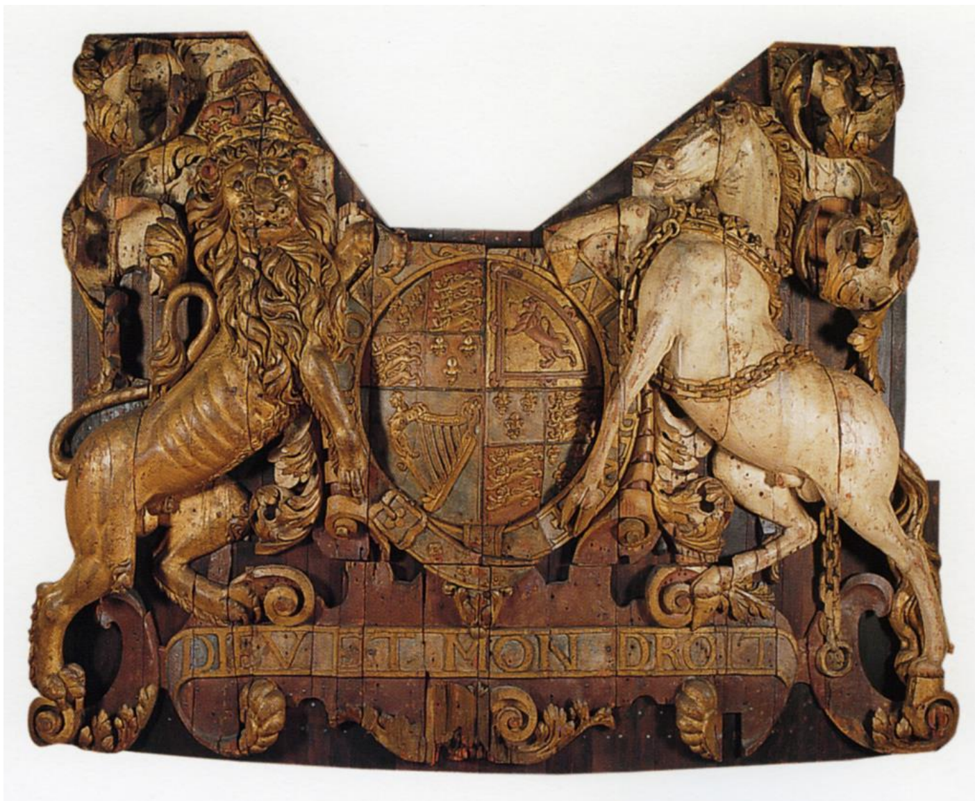
Part of the Stern decoration from the Royal Charles. Admiral de Ruyter brought back the English flagship back to Holland after capturing it during a raid on the Royal Dockyard at Chatham in 1667, Rijksmuseum, Amsterdam.