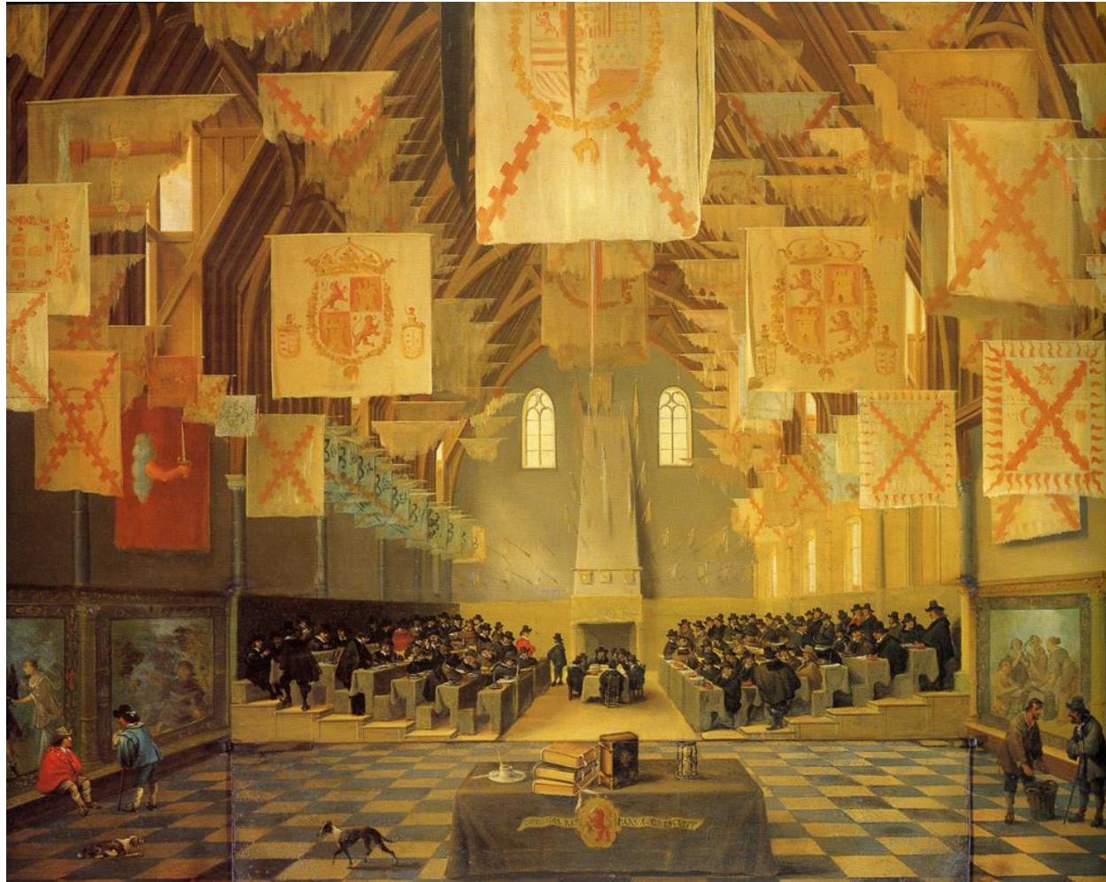
The States General Meeting in 1651 in the Ridderzaal, the Great Hall, Binnehof, The Hague, Dirck van Delen, oil on panel, Rijksmuseum, Amsterdam