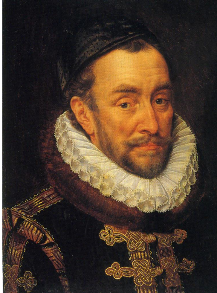
Prince William of Orange (William the Silent, 1533-84), Adriaen Thomasz. Key, late 16 th century, oil on wood panel, Rijksmuseum, Amsterdam.