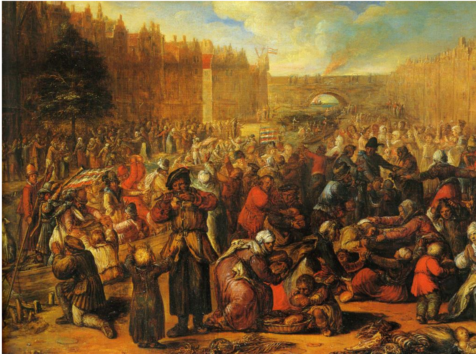
Spice, Bread and Drink in Leiden , Otto van Veen, dated October 3, 1574, oil on wood, Rijksmuseum, Amsterdam The distribution of herring and bread after the relief of Leiden from a long Spanish siege during the Revolt of The Netherlands.