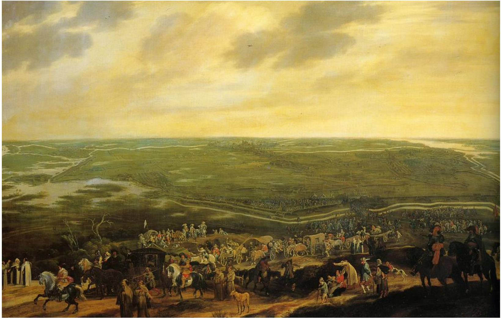
The Departure of the Spanish Garrison from 's-Hertogenbosch, September 17, 1629. Pauwells van Hillegaert, oil on canvas, Rijksmuseum, Amsterdam.