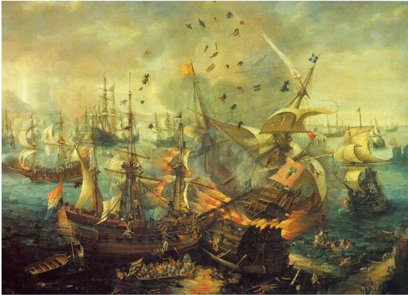
The Explosion of a Spanish Admiral's Ship at the battle of Gibraltar, April 25, 1607, Cornelis Claesz. Van Wieringen, oil on canvas, Rijksmuseum, Amsterdam.