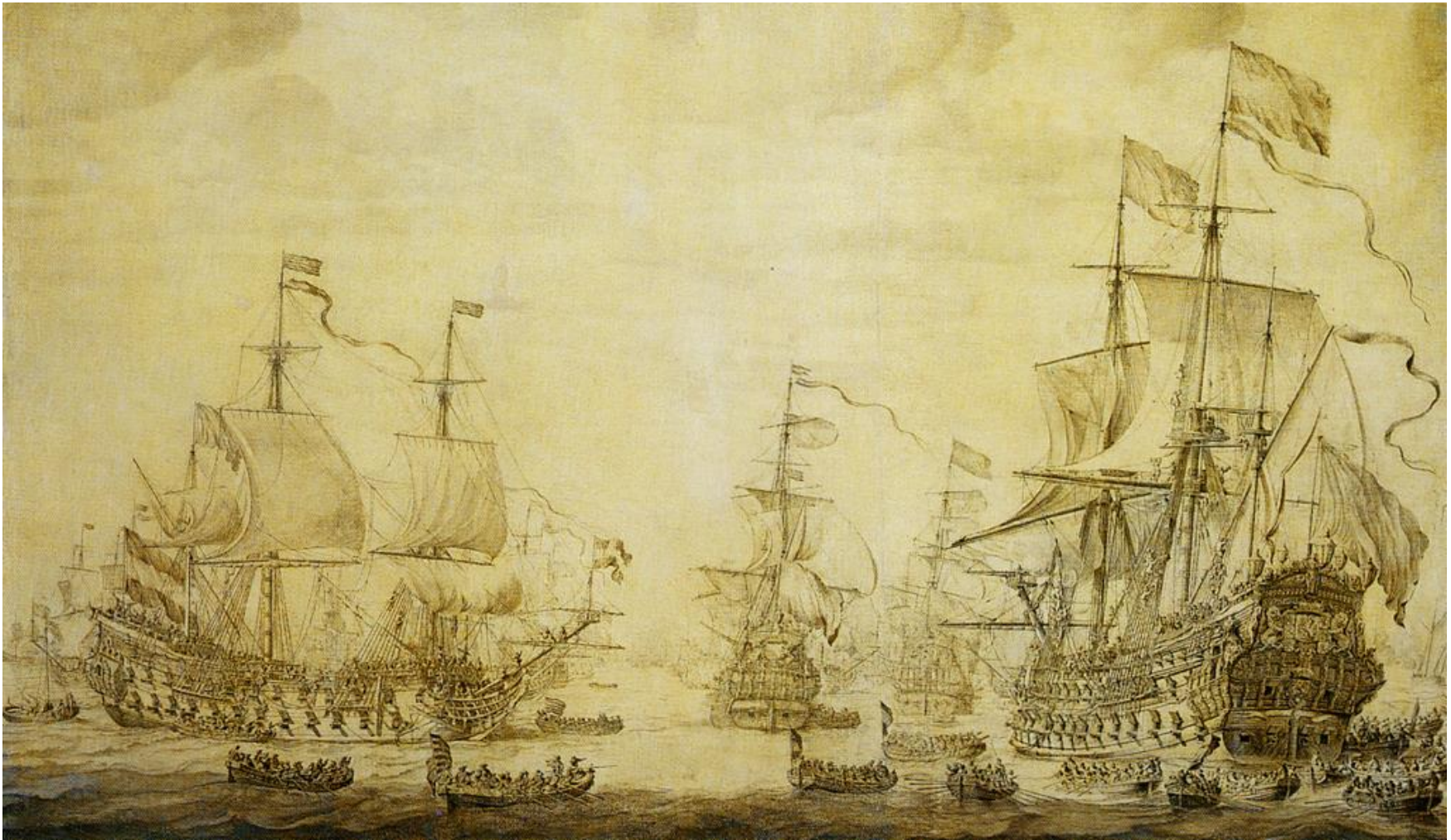
Council of War on the Seven Provinces, Admiral Michiel de Ruyter's ship, on June 10, 1666, the night before the Four-Day Naval Battle during the Second Anglo-Dutch War, Willem van de Velde, 1666, pen and ink, Rijksmuseum, Amsterdam.